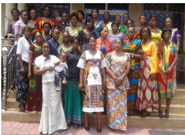
Figure 12: Participants at a WAFA national workshop (February 2016)

The Women's Academy for Africa (WAFA) has been an excellent example of women working together to enhance their political skills and confidence and make use of these skills to engage in political processes and apply for leadership or candidate positions. In recent months, the national workshops have enabled the network to spread its reach to women activists at the grassroots level across a range of countries on the continent. Participants learned about women's empowerment, leadership, campaign and media skills. More generally, participants involved in the Women's Academy for Africa have taken up leadership positions in their respective parties and countries, with one women leader saying she "wouldn't have done it" without the empowerment programmes provided by WAFA and the Labour Party.