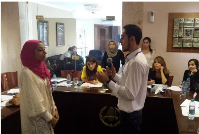
Figure 15: Interview practice at the Future Leaders training in the MENA region (October 2015)

Within our MENA region programme we developed a Future Leaders' project where participants received training on public speaking, campaigning, press strategy and leadership skills. The participants are now looking to take ownership of a more formalised regional youth network, and as result of the training colleagues from Lebanon used the skills gained to organise local campaign seminars.