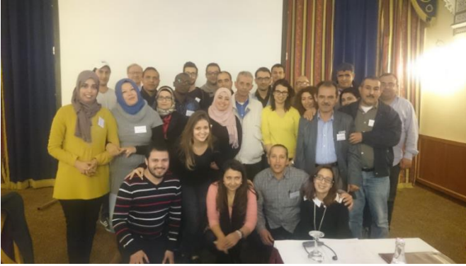
Figure 11: Participants at a workshop for local candidates and organisers (March 2016)

In Tunisia, we have continued our work to support policy-making and communications strategies, ahead of local elections in 2017. The training has helped candidates and organisers with voter targeting, rebutting criticisms from other parties and crystallising their message to citizens.