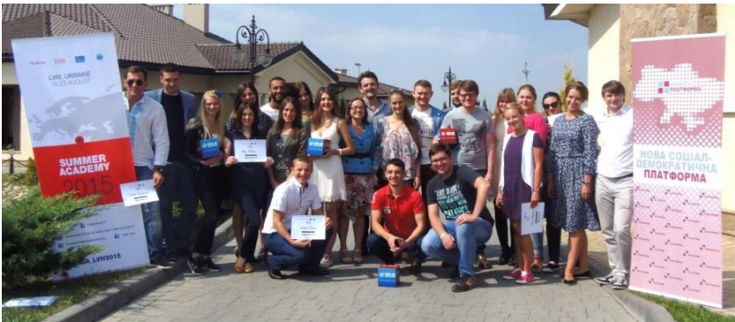
Figure 2: Participants at the Eastern Europe Summer Academy (August 2015)