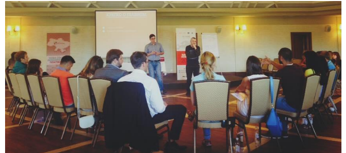
Figure 16: Workshop at the Summer Academy 2015 in Ukraine (August 2015)

messages and interview techniques. Participants were galvanised to mobilise supporters in their organisations and utilise the skills learned to full effect.