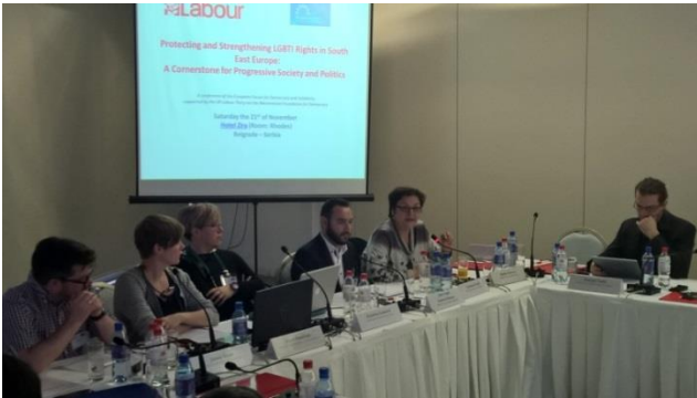
Figure 7: Protecting and Strengthening LGBTI Rights in South East Europe Conference (November 2015)

parties and experts. As a result, participants will now work together to look at further support work from the social democratic parties in the region, including helping them to establish networks for their LGBT members.