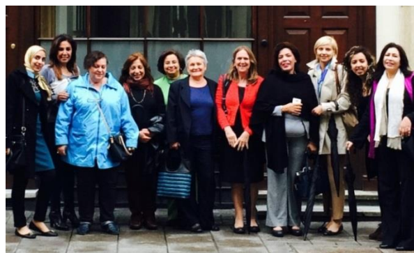
Figure 4: Women's Mentoring Platform – MENA Regional Conference (June 2015)

from Egypt in particular through the mentoring programme was recognised when she was selected as one of the young members of the Global Thinkers Forum 2016 and another was invited as a speaker to a conference in Brussels marking International Women's Day.