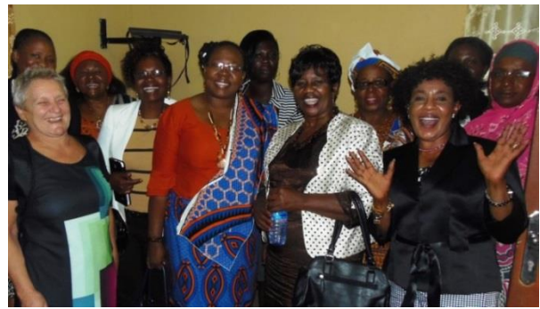
Figure 6: WAF Executive members at evaluation meeting in Ghana (September 2015)

Our continued support for the Women's Academy for Africa (WAF) facilitated the holding of four regional workshops to help develop an action plan for the network as well as a pool of trainers in each country. An evaluation meeting was held in September 2015, and following that, a number of national workshops have taken place to disseminate the benefits of the network. Women have received valuable training in women's empowerment, leadership, campaign and media skills and a training manual was produced.