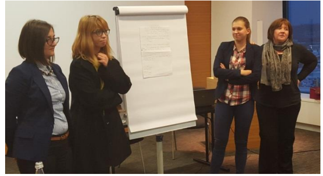
Figure 14: Mentoring pairs at the women's platform meeting in Slovenia (October 2015)

and cross-cultural exchange. As a result of the workshops, participants agreed action plans to continue work between mentoring pairs in the different countries and engage their party leadership in the need to promote better women's involvement.