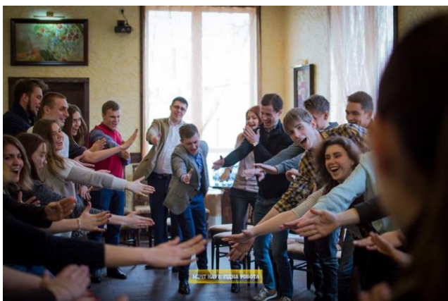
Figure 10: Young activists from the New Social Democratic Platform mobilising for the decent work campaign

The New Social Democratic Platform in Ukraine has strengthened its organisation and its communication and outreach, enabling it to recruit new members and reach more citizens. It held training sessions across the country on the key topics of employment and women’s rights, and presented its leadership through a press conference at one of the most recognisable press points in Ukraine the “Gorshenin Institute”.