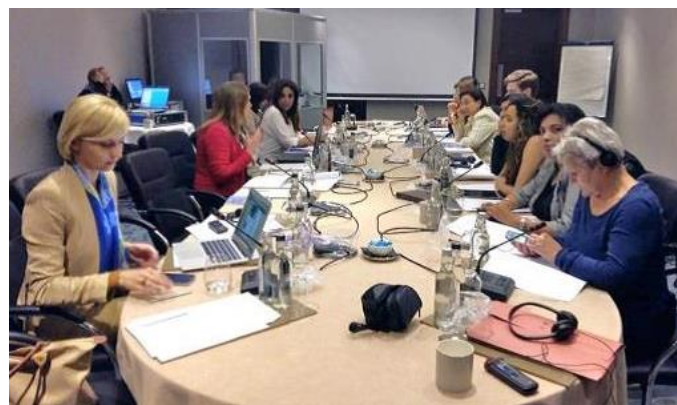
Figure 13: Tha'era members holding an evaluation meeting to discuss next steps (June 2015)

The Tha'era Arab Women's Network has given skills and confidence to its members against the background of an increasingly restrictive political climate. Following the fatal shooting of one of its members Shaimaa el-Sabbagh, the network rallied together and organised a coordinated national, regional and international campaign calling for the police officer responsible to be held accountable. Evaluation sessions led to a strategy plan formulated around registration, communication and expansion. The network has since supported the development of a feminist journal named in memory of Shaimaa, and a regional workshop in Beirut on best practice in fighting for women's equality in politics including through electoral quotas.