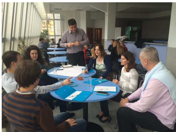
Figure 8: Participants at party development workshop in Montenegro (March 2016)

In Montenegro, our partners organised regional party development workshops with our support, familiarising grassroots activists and party members with policy formation. Concrete steps were made towards developing consultative structures. As a result, the municipal boards represented agreed to replicate the training at the local level.