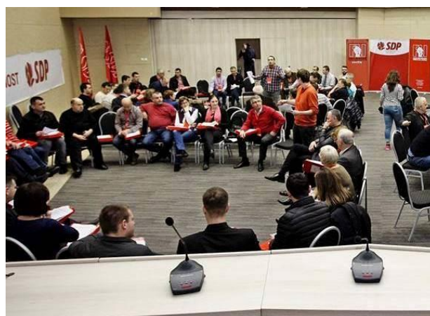
Figure 5: Conference in the Western Balkans to implement new consultative policy-making process (February 2016)

Through the training and capacity-building programme we facilitated, some of our partners in the Western Balkans have developed a consultative policy-making process, enshrined into their party statute, and moved to a democratic process of leadership selection through one-member one-vote.