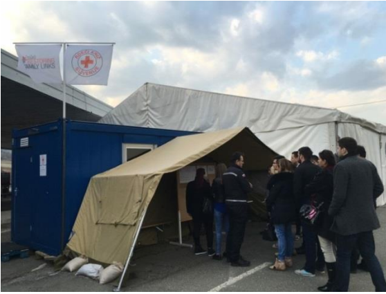
Figure 17: SD9 study visit to Šentilj refugee centre, Slovenia (March 2016)

The SD9 coordinators have held regular discussions, including on closer cooperation with the wider movement including the Young European