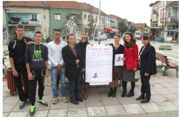
Figure 3: Young activists in Niš, Serbia

establish new local branches and develop stronger links with wider stakeholders ahead of future electoral challenges.