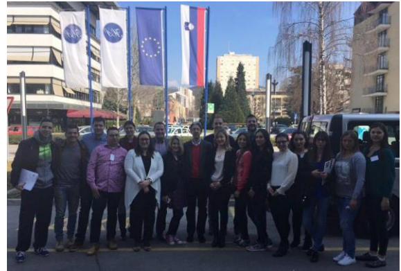
Figure 18: Participants at SD9 conference on migration (March 2016)

Socialists. These will continue in the coming months.