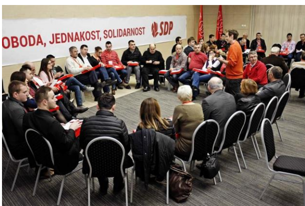
Figure 9: Public policy-making training in Bosnia and Herzegovina

Following policy forums supported by this project, our partners in Bosnia and Herzegovina (BiH) passed amendments to its Statute to commit to a 2-year policy-making cycle. In addition, the Youth Forum developed a policy document on the legislative changes needed to implement a work experience programme for young people in Bosnia and Herzegovina. The document was developed along with the amendments needed to the existing legal framework. This was followed by a street campaign and petition signed by young people in the majority of cities and municipalities.