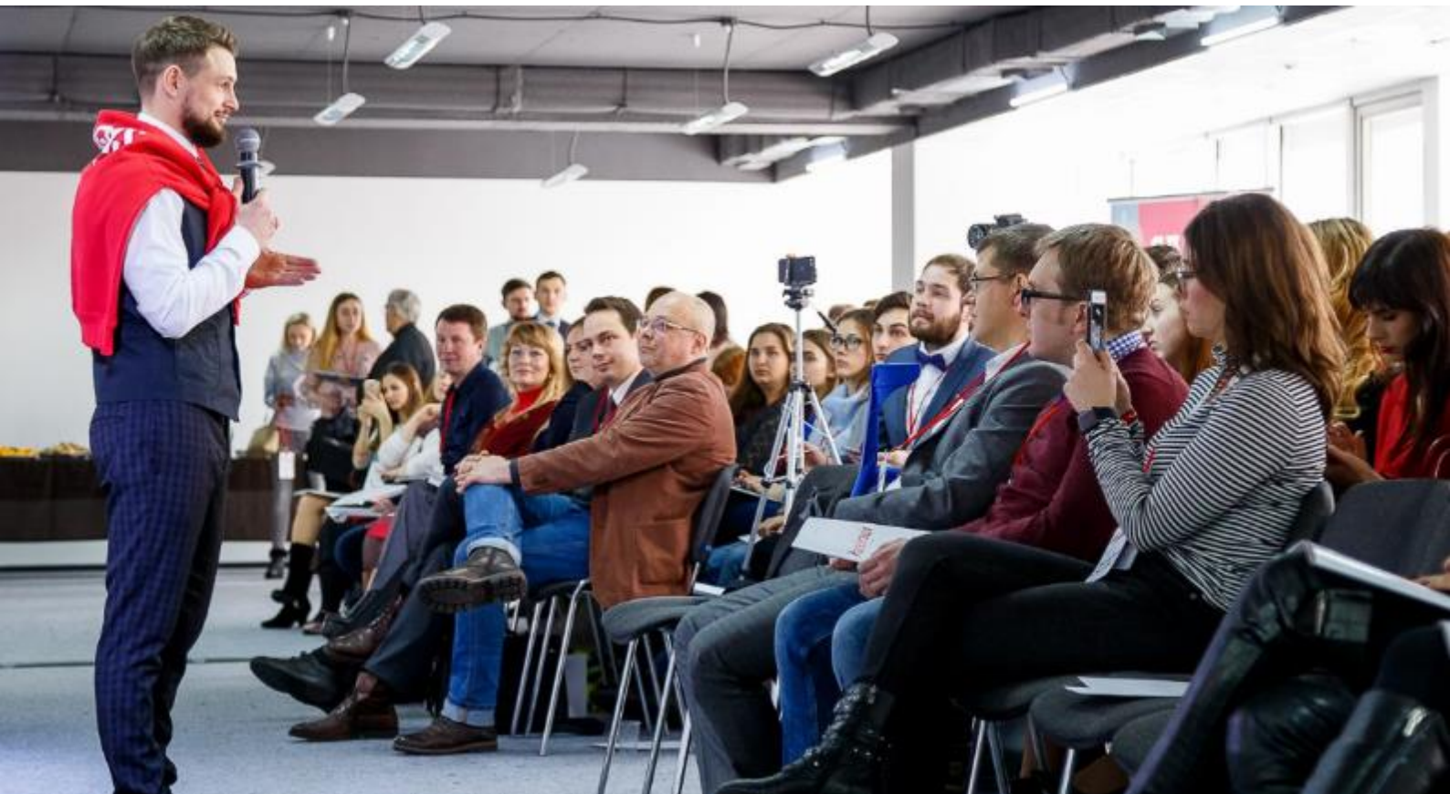
Figure 8: Partners from the SD Platform addressing a Forum of Progressive People in Ukraine