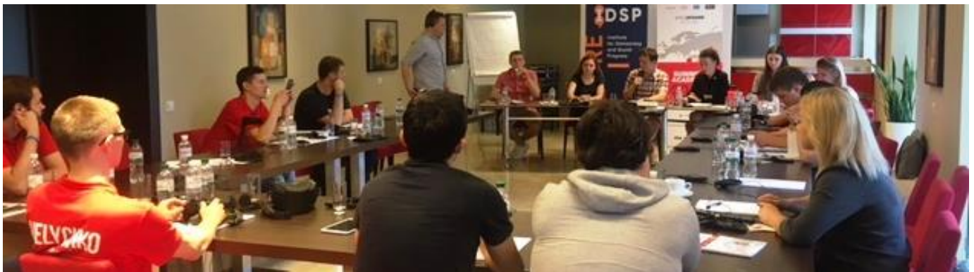
Figure 12: 2017 Summer Academy

This year, the Labour Party organised a pilot leadership training programme in Bosnia and Herzegovina to improve the leadership skills of women members and potential candidates ahead of the 2018 elections. This was targeted to women who have sought or will seek public office and are able to cascade skills to their colleagues.