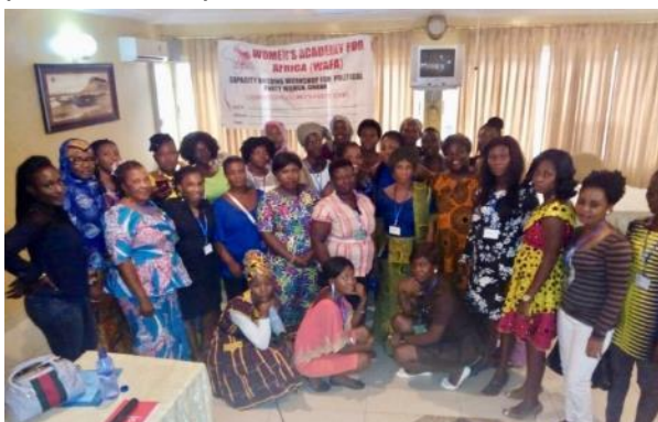
Figure 2: WAFA National Workshop in Ghana

In the centenary year of the Representation of the People's Act, the Labour Party continued to support and develop the skillset of social democratic women to play an active role in party politics and public life.