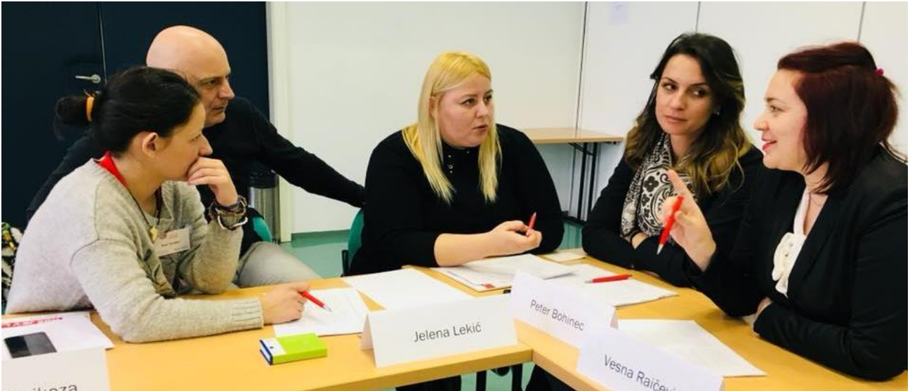
Figure 3: Policy Development workshop in the Western Balkans

party structures ahead of upcoming elections in order to present the electorate with a social democratic alternative.