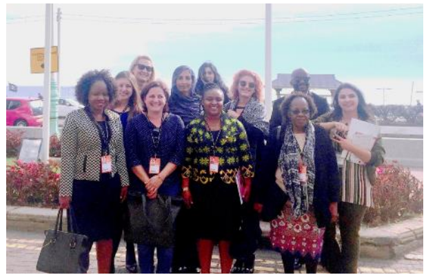
Figure 6: 2017 Annual Conference Best Practice Programme

Building on previous support for LGBTQ activists, a fringe event was organised in cooperation with Rainbow Rose at WorldPride in Madrid. The event was chaired by a member of the Labour Party's NEC, and the panel comprised of party activists and networks from the Western Balkans advocating for a political and cultural shift on LGBTQ issues. It highlighted that further work is needed to change political and public attitudes, and pave the way for a more liberal and respectful society.