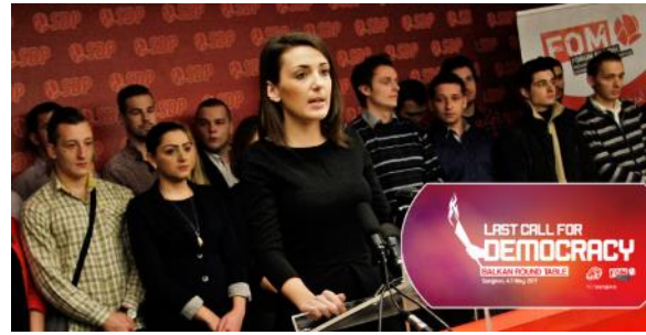
Figure 11: SD9 host roundtable in Sarajevo