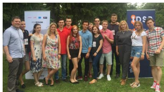
Figure 10: 2017 Summer Academy

The Summer Academy Alumni event highlighted that participants utilised the skills learnt during the Summer Academy training to stand for elections and campaign within their organisations.