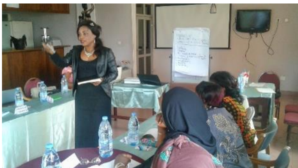
Figure 9: WAFA National Workshop in Cameroon

parliamentary elections as a result of the skills and confidence she gained during the WAFA training.