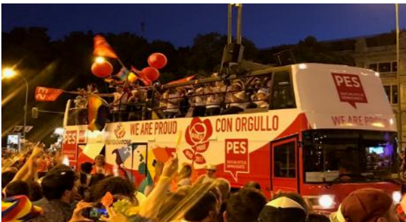
Figure 5: WorldPride in Madrid

the Slovenian Social Democrats' preparation for the 2017 Presidential elections; both from the perspective of senior party stakeholders and from local campaigns. This visit also contributed to the development of regional dialogue to facilitate the continued sharing of knowledge and experiences amongst political parties in the Western Balkans.