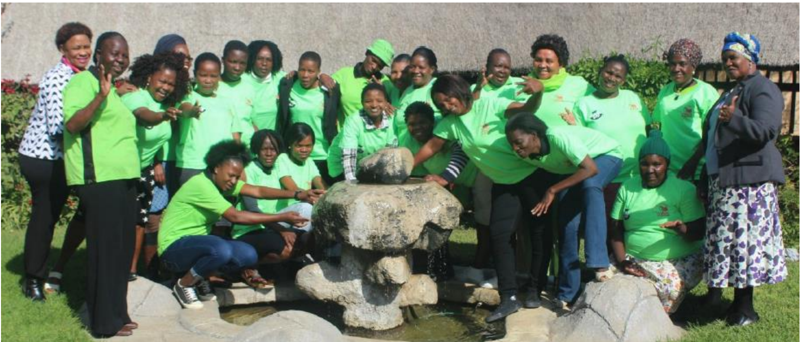
Figure 1: Participants at the Women's Academy for Africa (WAF) National Workshop in Botswana