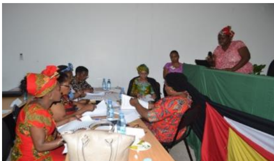
Figure 4: Wafa National Workshop in Mozambique

Wafa has been an excellent example of women working together to enhance their political skills and confidence and make use of these skills to engage in political processes, applying for leadership or candidate positions. The national workshops enabled the network to spread its reach to women activists at the grassroots level across a range of countries on the continent. Participants trained on leadership, campaign and media skills. Through Wafa, beneficiaries have succeeded in taking public office, been appointed government ministers, stood as parliamentary candidates and organised as activists.