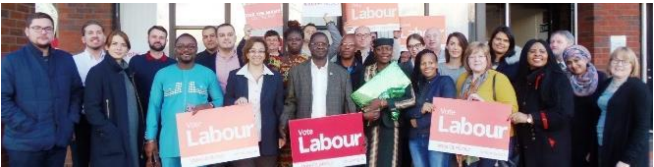
Figure 7: Elections Best Practice Study Visit to Manchester

Following the completion of the 2015-17 Summer Academy programme, the Labour Party in cooperation with the Foundation Max van der Stoel (FMS) organised an alumni event in The Hague to evaluate the programme's impact by bringing together a selection of past beneficiaries of the programme. The feedback from the visit will help to design future Summer Academy programmes.